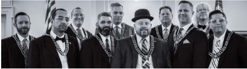
JOHN BLAIR LODGE NO. 187, A.F. & A.M., 2017 OFFICERS